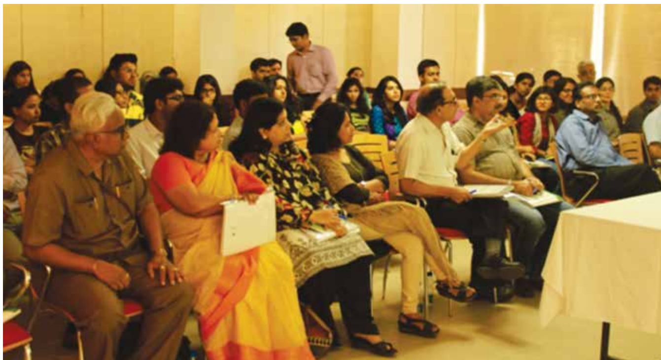
View of audience at the workshop