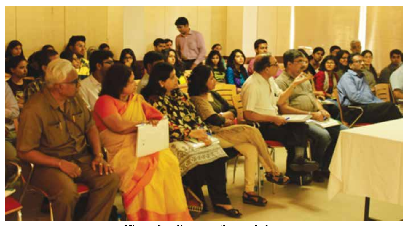
View of audience at the workshop