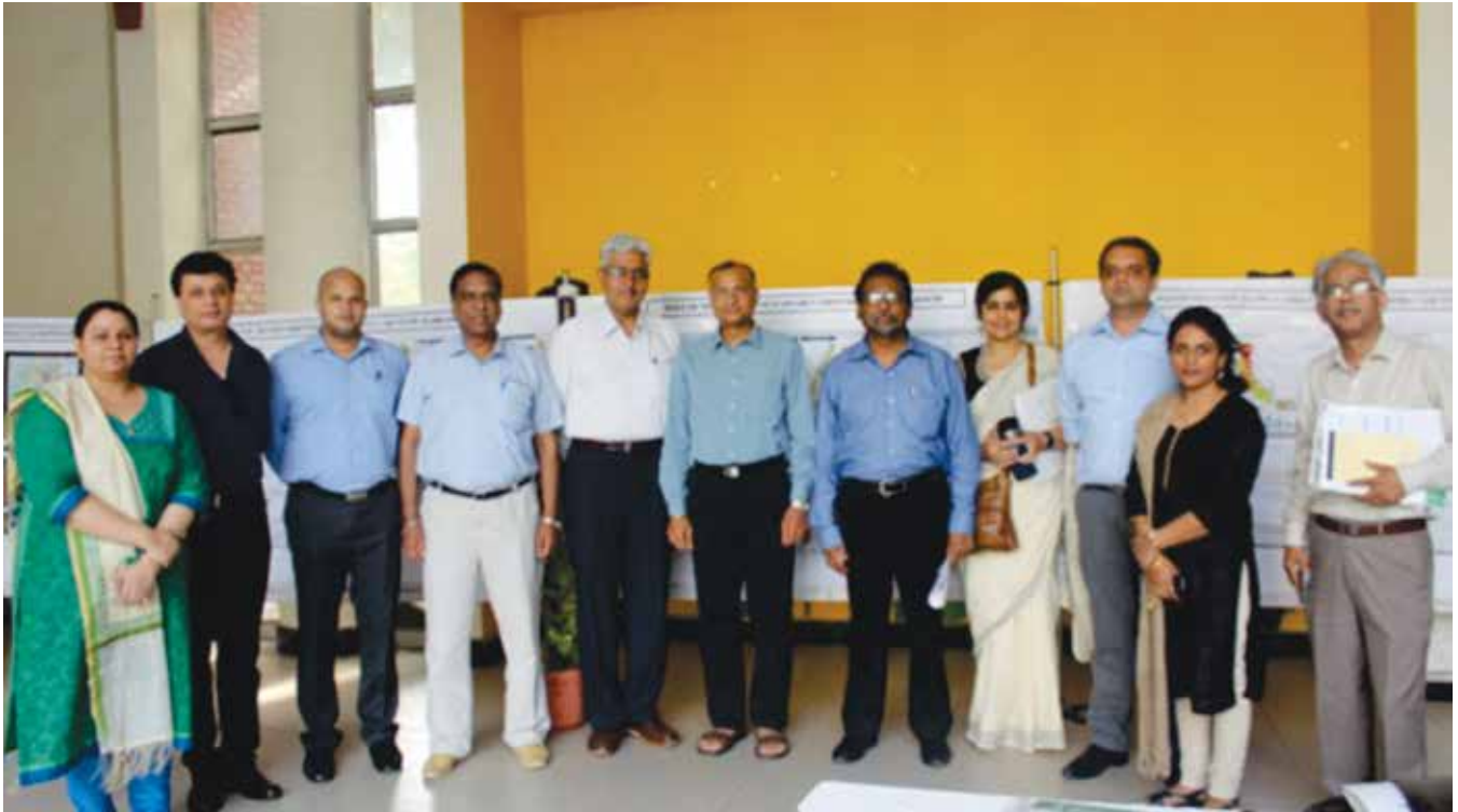
Invited speakers and experts with faculty at the workshop