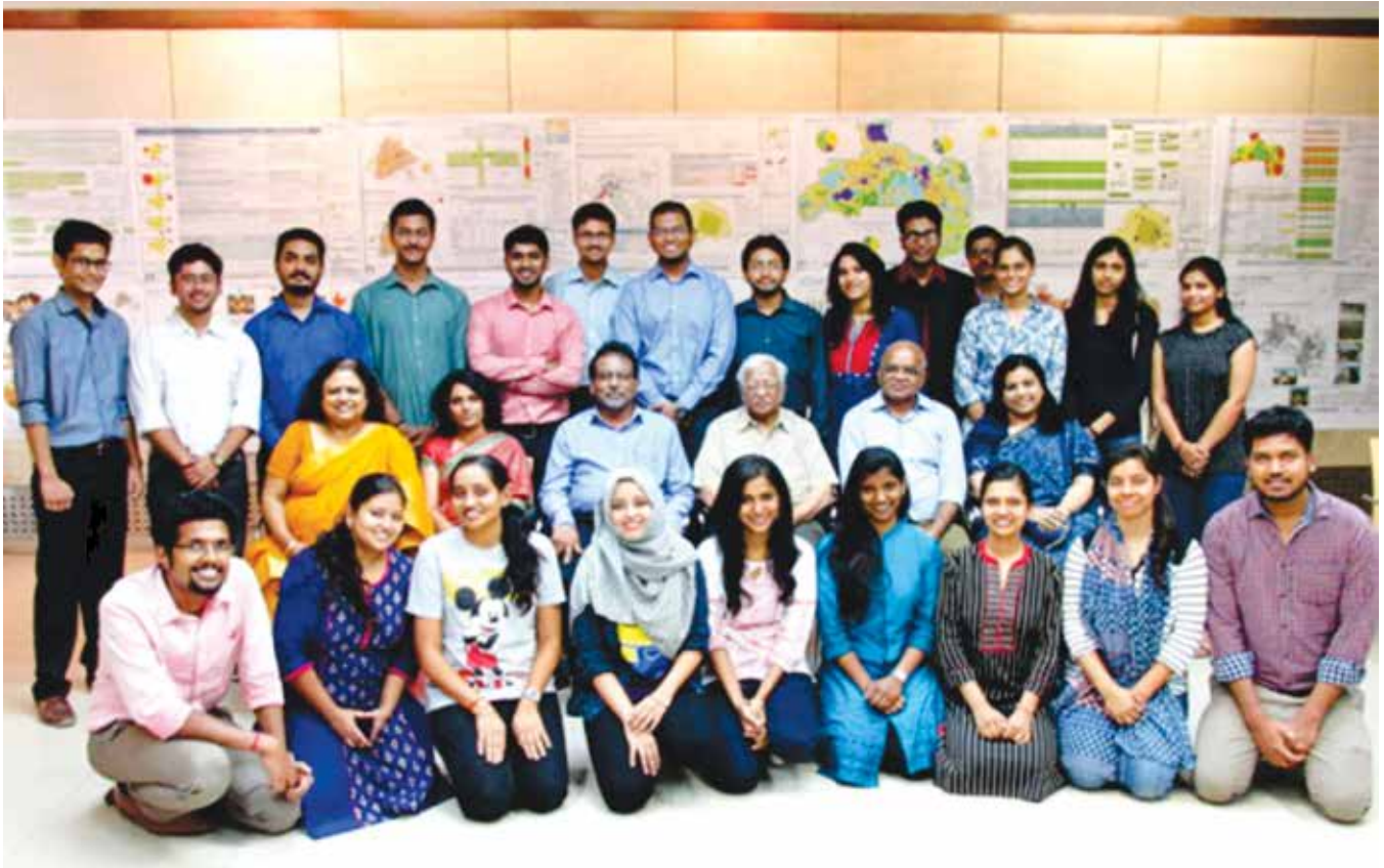
4 th semester students with jury examiners (May 2016)