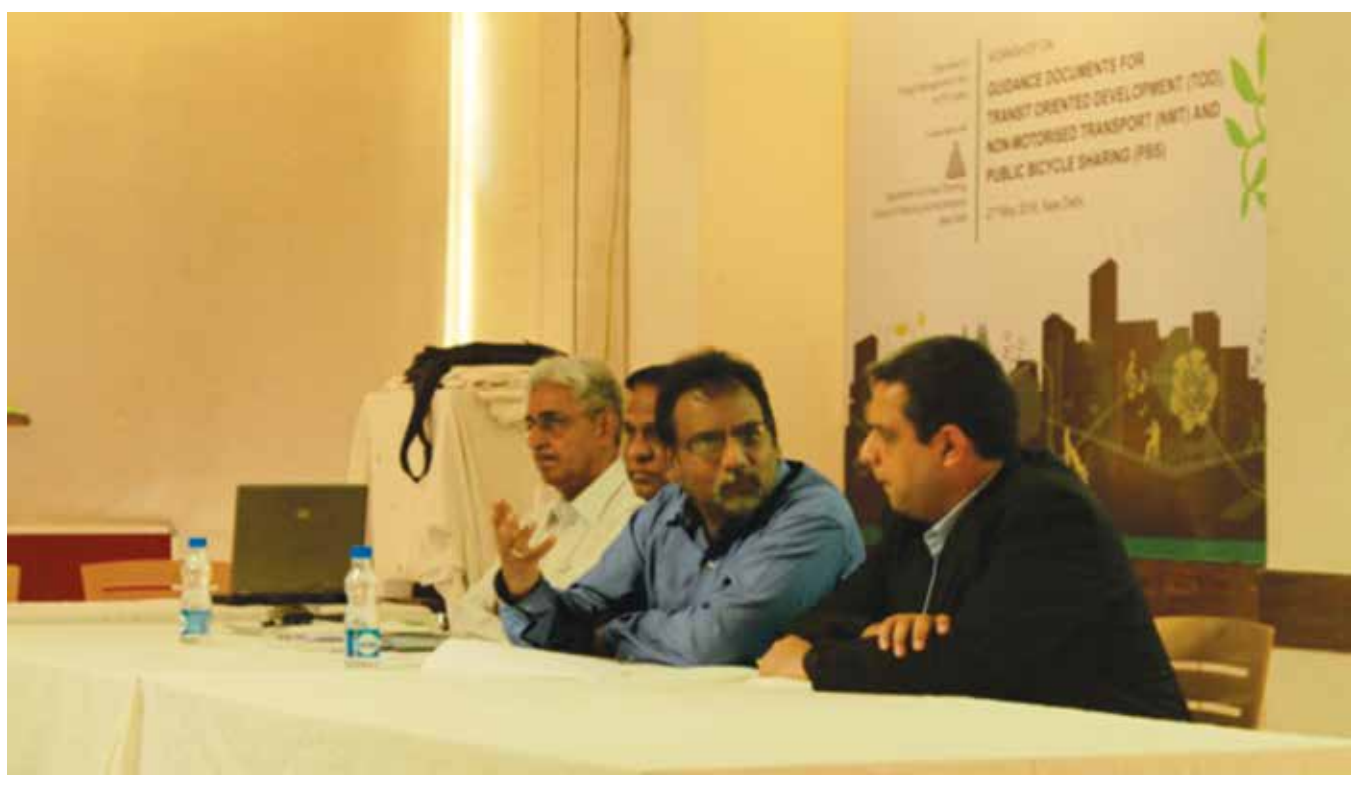
Workshop technical session in progress