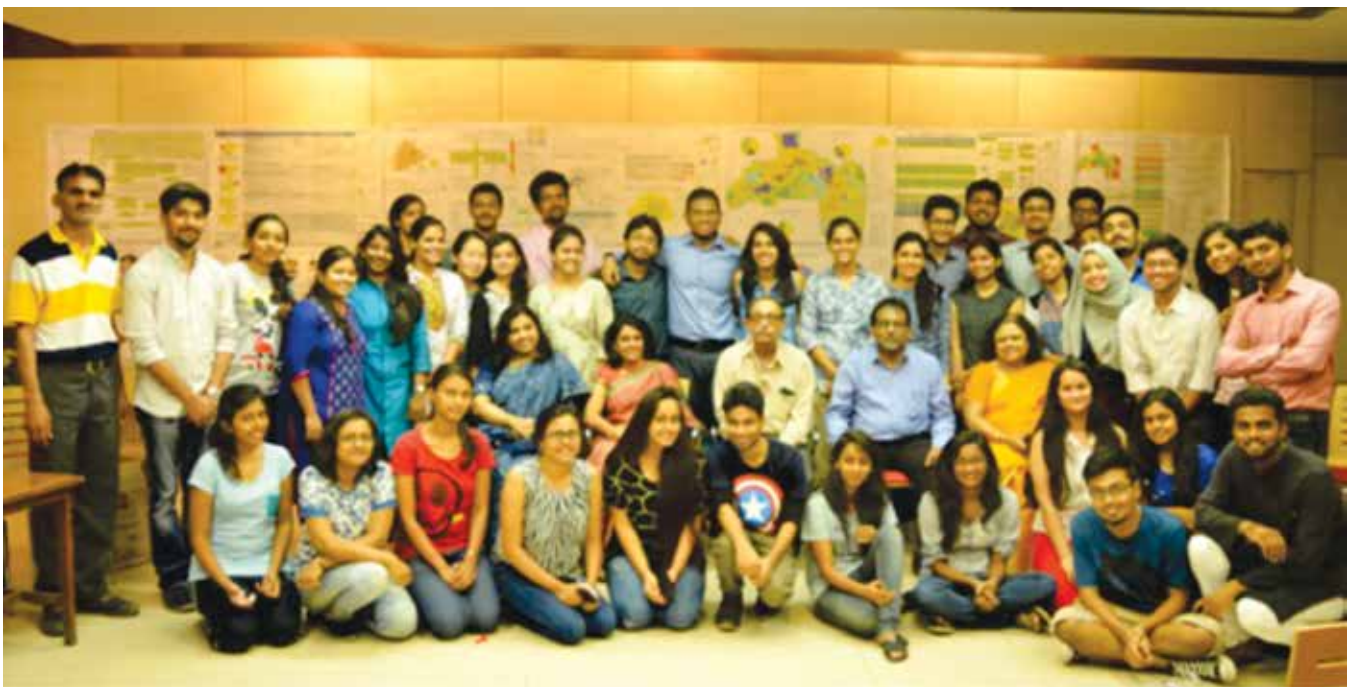
2 nd semester students with faculty after studio jury examination (May 2016)