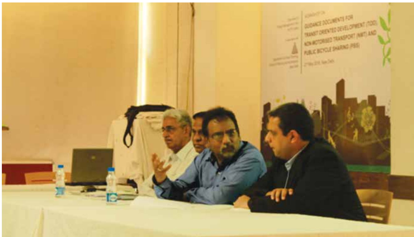
Workshop technical session in progress