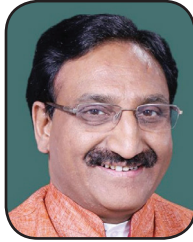
Dr. Ramesh Pokhriyal 'Nishank' Hon'ble Minister of Education, Government of India CHAIRPERSON, SPA COUNCIL