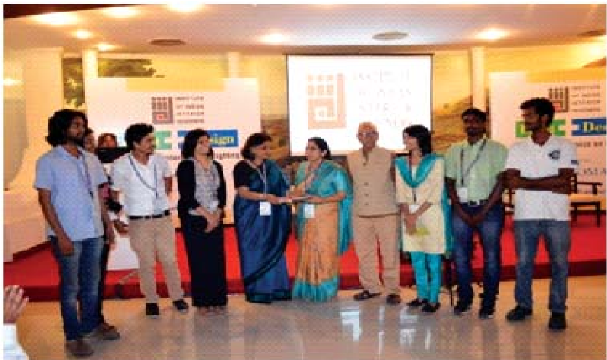
Third semester students along with the faculty won an award for an Installation at IIID Conference, PragatiMaidan, New Delhi, September 2014