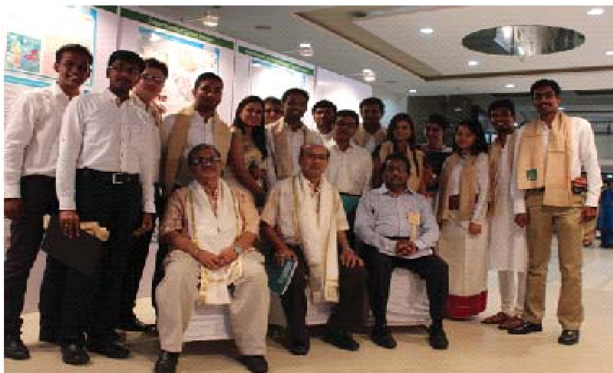
Outgoing students of Transport Planning Department during 32nd Convocation of SPA, Delhi