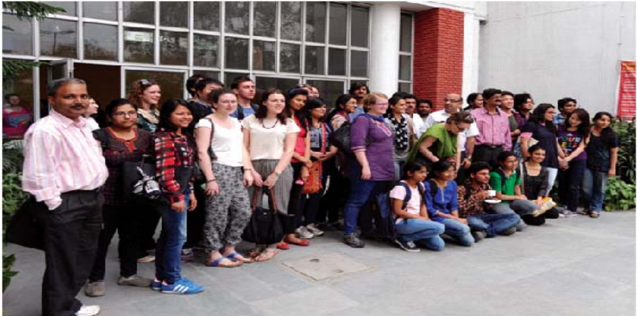
B. Planning students with students and faculty from University of Newcastle Upon Tyne, UK