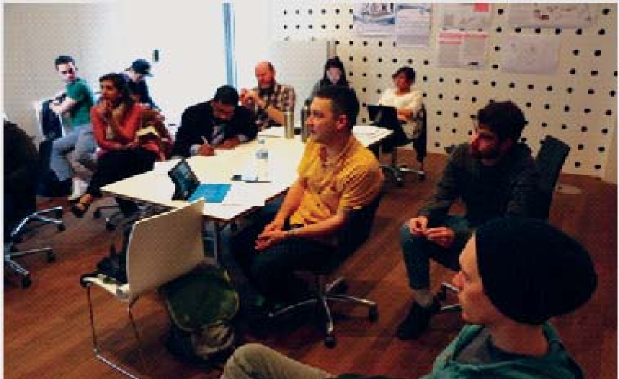
Faculty from Department of Industrial Design conducting a design studio at the RMIT University, Melbourne, Australia.