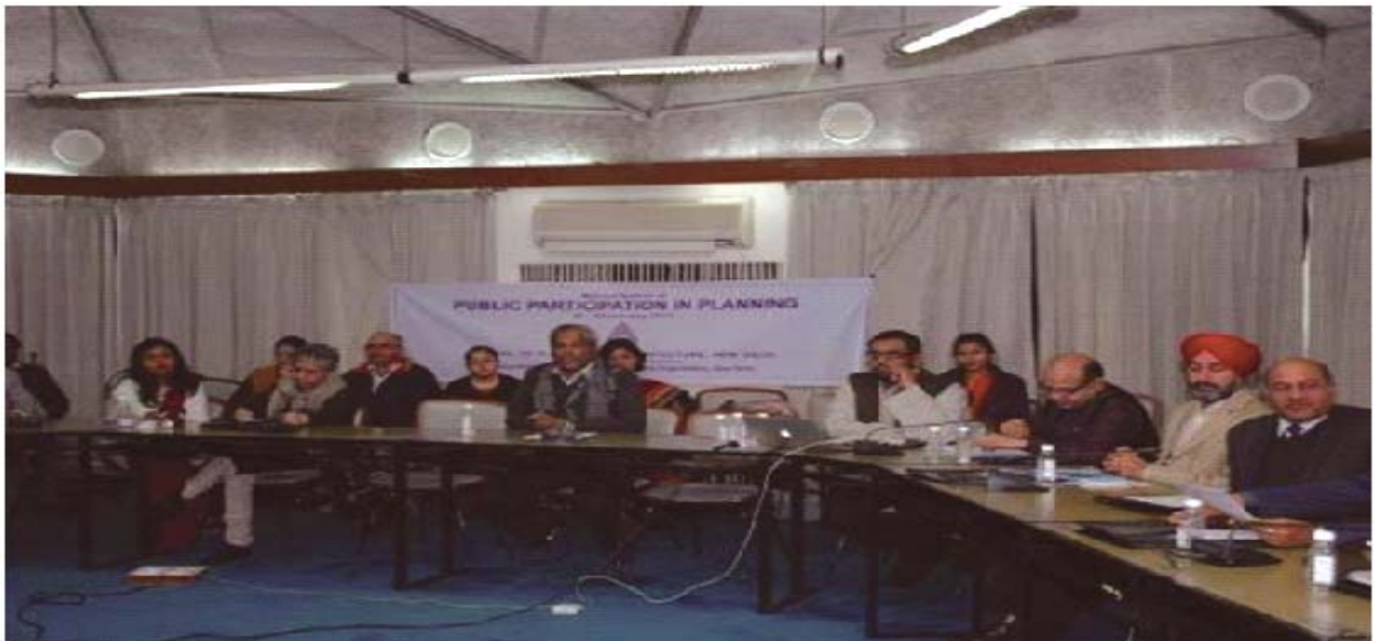
Seminar in Public Participation in Planning organized by the Department of Physical Planning