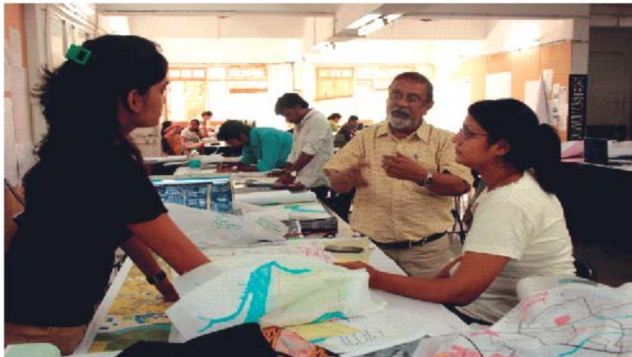
Third Semester Students at SPA-KRIVA Joint Studio,Mumbai