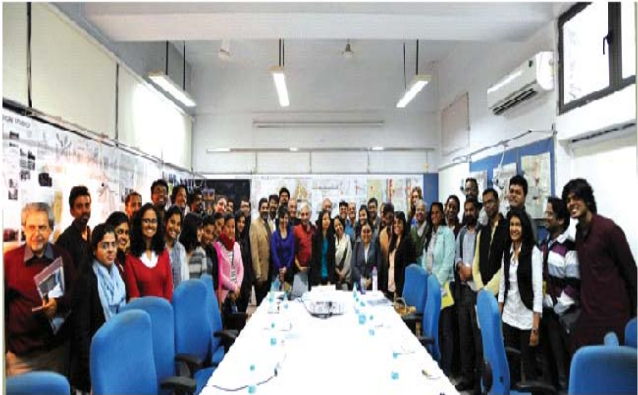
Plenary Session at 'Urban Design for Urban Development', national workshop organized by Department of Urban Design in February 2015