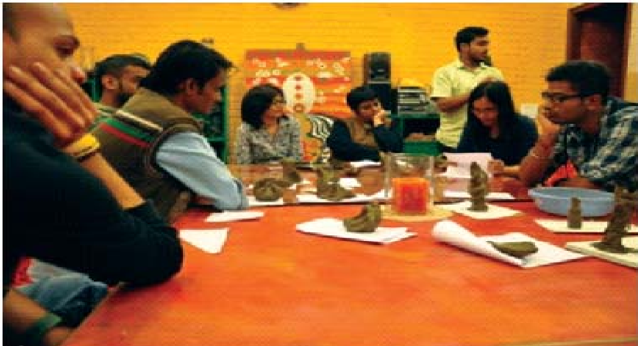
First semester students attended a Clay Workshopat Learn Something Different, New Delhi, October 2014