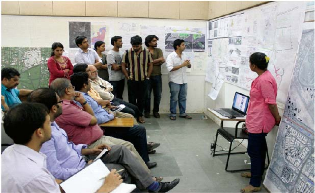
Final Presentation of SPA-KRIVA Joint Studio, New Delhi