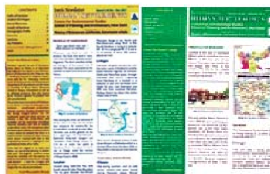
ENVIS publication - News letters