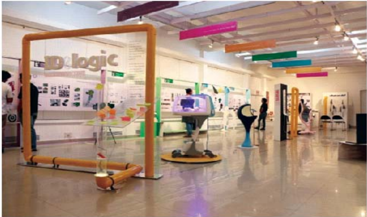
Design Degree Show 2015 exhibiting work works of graduating students of Master of Design Program