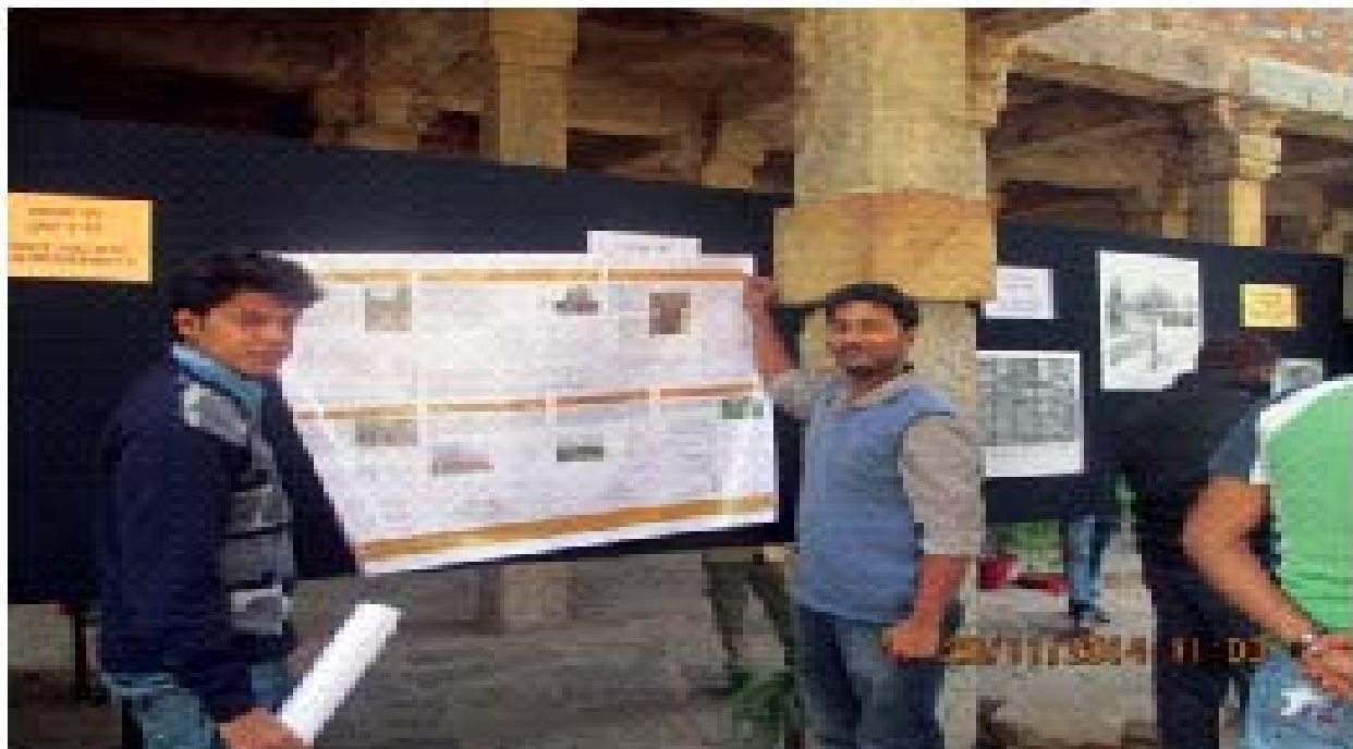
Display of the 1st Semester students' work on Mehrauli Archaeological Park in the exhibition at the Qutb World Heritage Site organized by the Archeological Survey of India for the World Heritage Week celebration on 20th November 2014