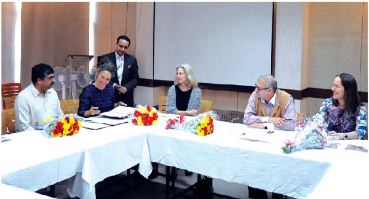
MoU Signing of SPA Delhi with University of Heidelberg, Germany