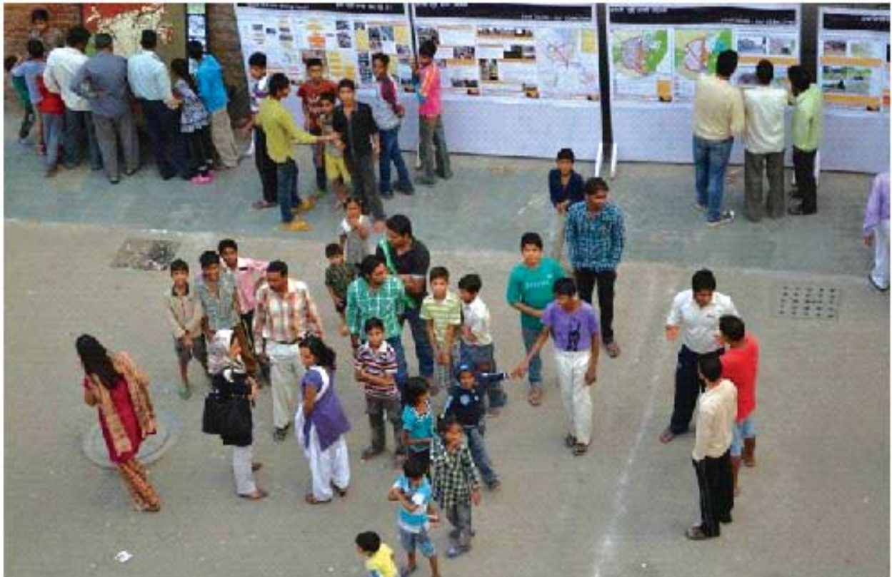
Public meeting and Design Display within the community as part of 3rd Semester Studio of Urban Design