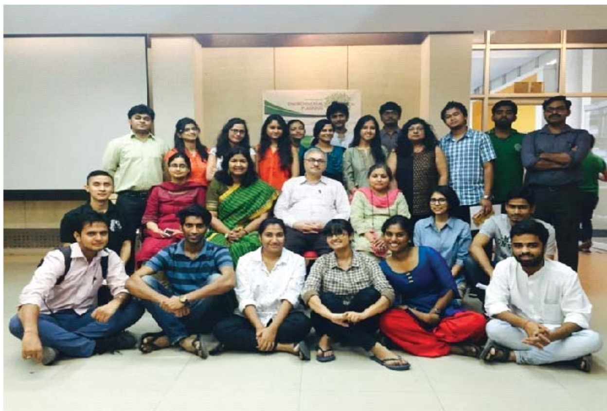
Seminar presentation by Fourth Semester for Celebration of 25 Years of Department