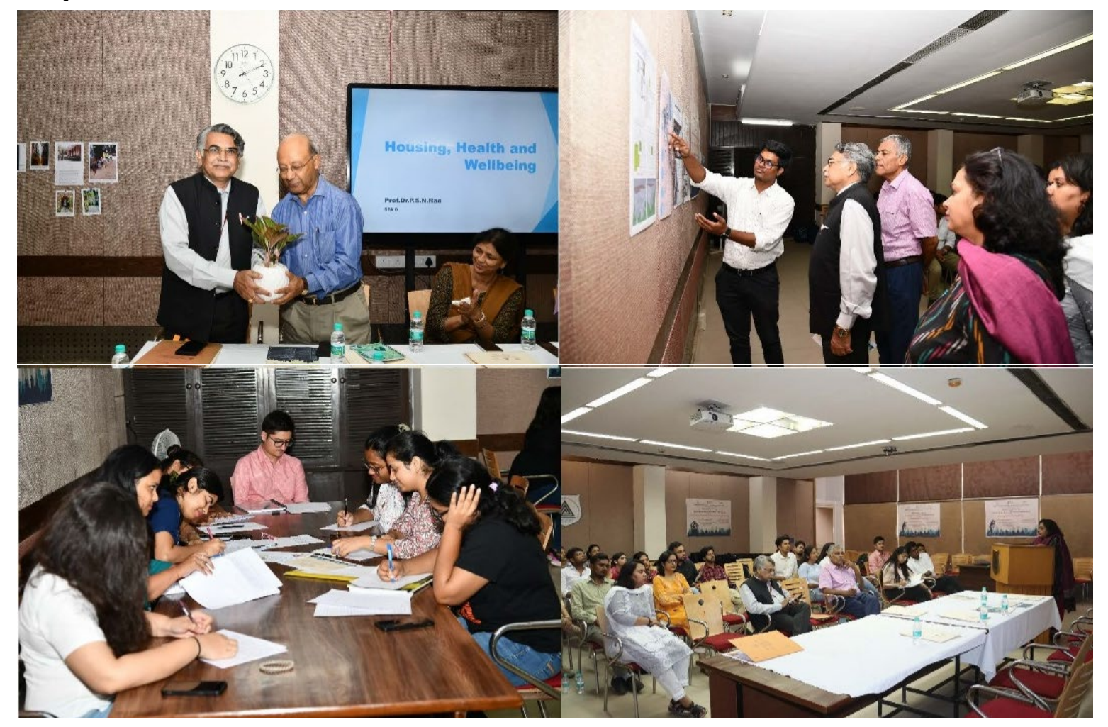
The competitions are as follows: Healthy Modular home, design and poster making, Essay Writing, Photography